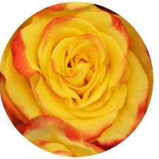
High & Yellow