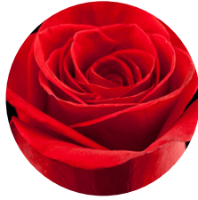
Freedom (50 and 60 cm)