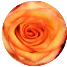
High & Magic