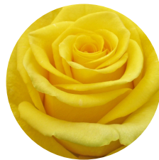
High & Yellow Magic