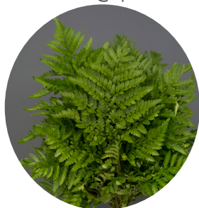
LEATHERLEAF (Florida) GLL10