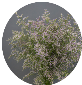
MISTY BLUE LIMONIUM FLIMO