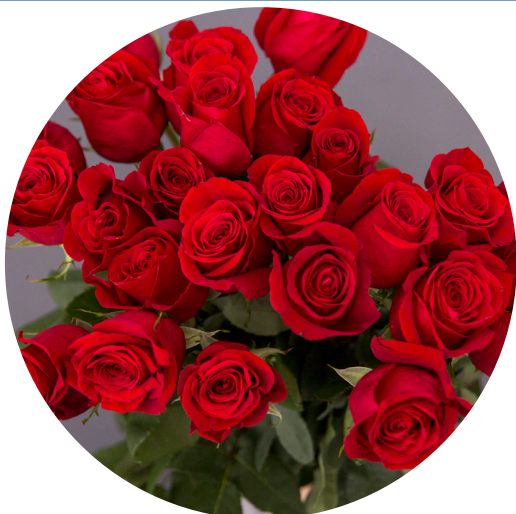
FREEDOM ROSES FROFR