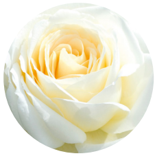
Creme de la Creme