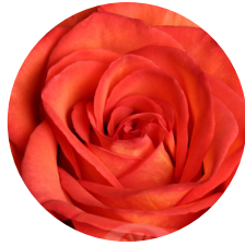
High & Orange Magic