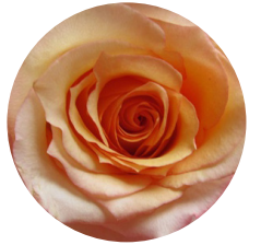
High & Sunshine