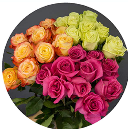
ASSORTED ROSES FROCO