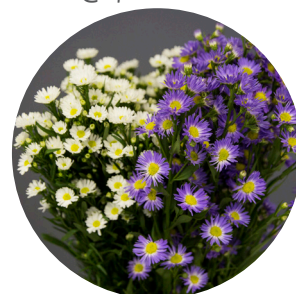
MONTE CASINO FMOCA